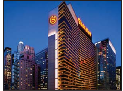
Sheraton New York Hotel & Towers 811 7th Avenue 53rd Street New York, NY 10019

At this year's Twenty-Fourth Annual INFECTIOUS DISEASES IN CHILDREN Symposium, to be held November 19-20 at the Sheraton New York Hotel & Towers near Times Square, we expect more than 700 pediatric professionals in attendance.